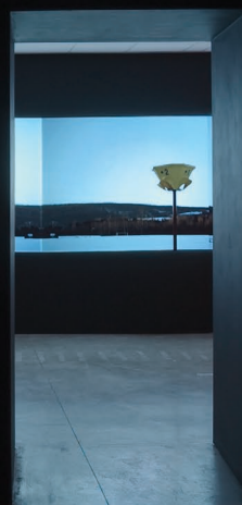
Automatic Speleology (view of the vault), 2010

Computer controlled robotics Color changing spotlights Glass resonators